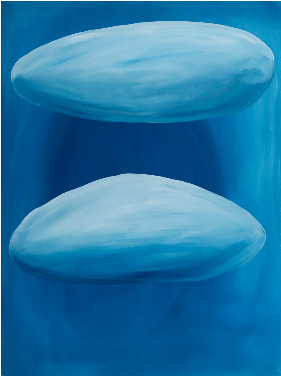
Templo Paralelo 2021 André Mendes 80x60cm Oil on canvas R$8.600

The creation of a body with different interpretations transcends matter, creating a reflection on the limits between space and the body and on the linearity of time.