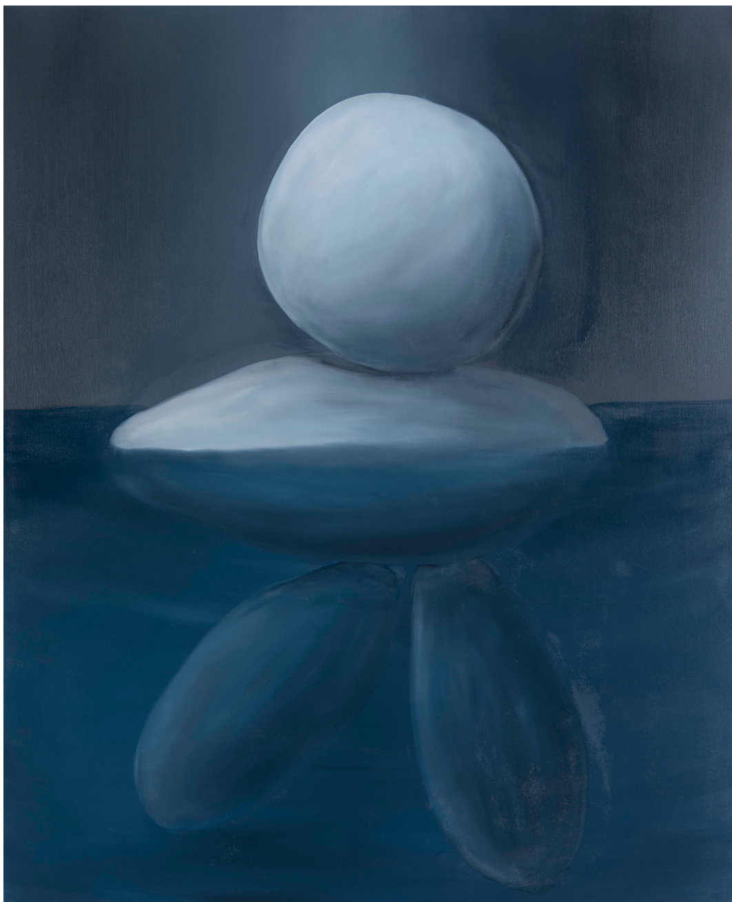
Gruta 2022 André Mendes 110x90cm Oil on canvas R$14.800