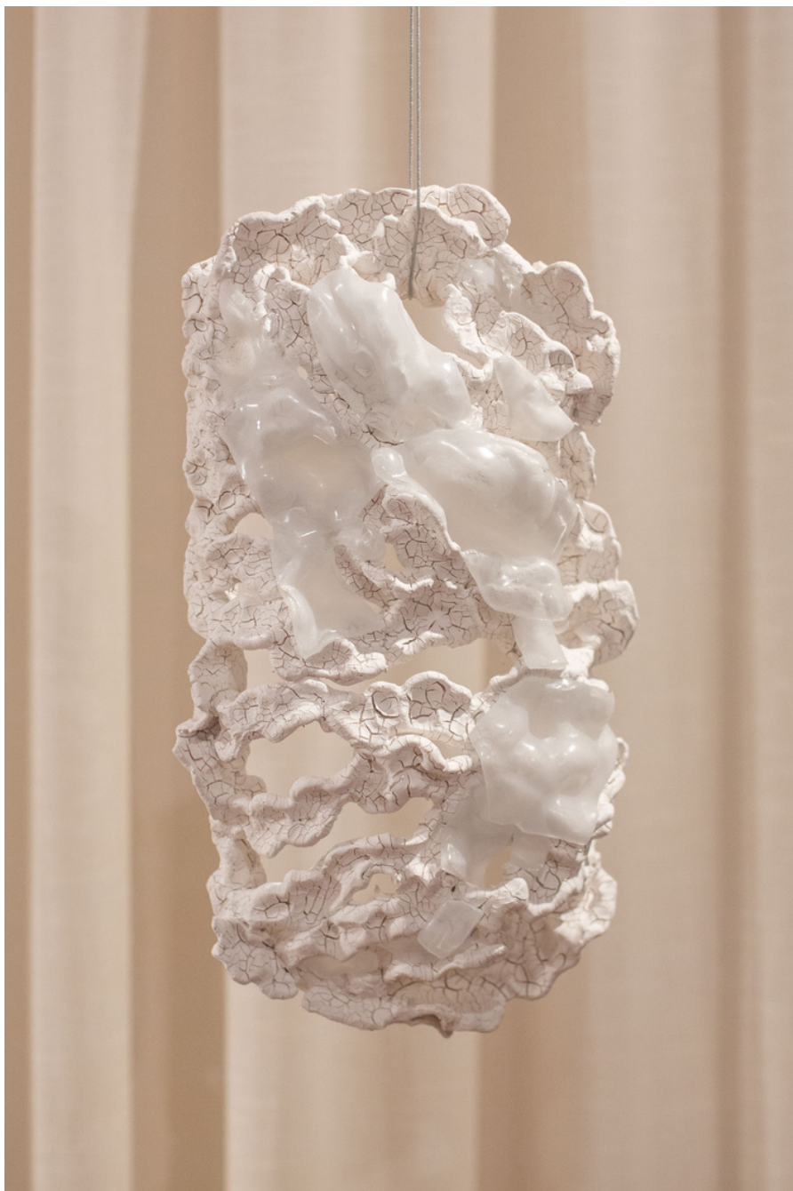
Costela n.11 2023 30Wx50Lx12H cm Ceramics and glass R$11.200