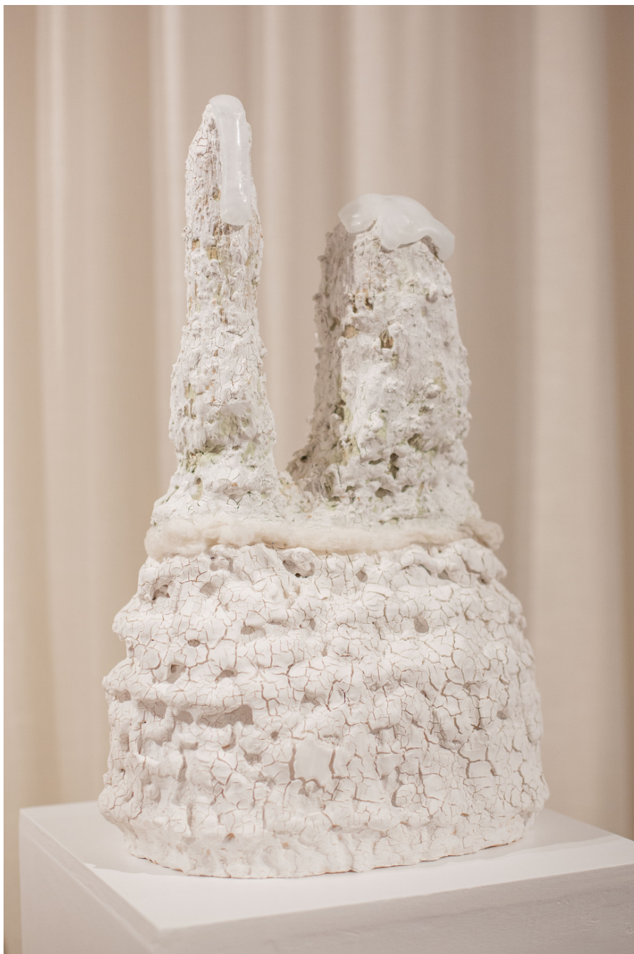
Lava Dome 2023 35Wx30Lx60H cm Ceramics, glass, and wool R$13.200

Overflow as rupture. Erotic opening, continuous. The attack against solidity or unity; the propensity of things to stick together, fall apart, or flow hopelessly through one another. It is the beginning, the outside and the inside. The way we connect, also seeking to understand the waters that are between us.